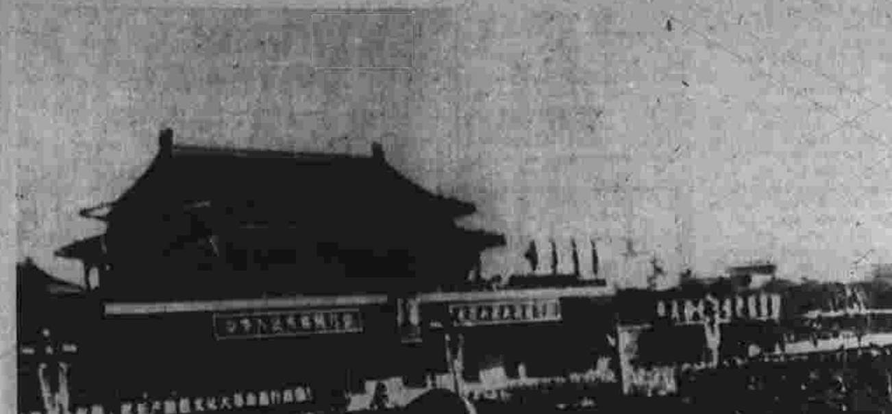
Marking an Anniversary

629 MAIN ST. 649-8482... Open Daily 9 A.M. to 9 P.M. Sat. 9 A.M. to 4 P.M.