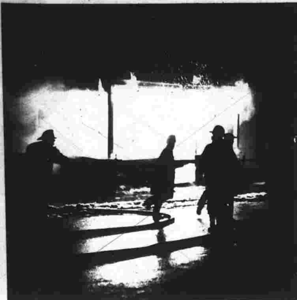
The Red Cross Stands by in Fires and Other Misfortunes