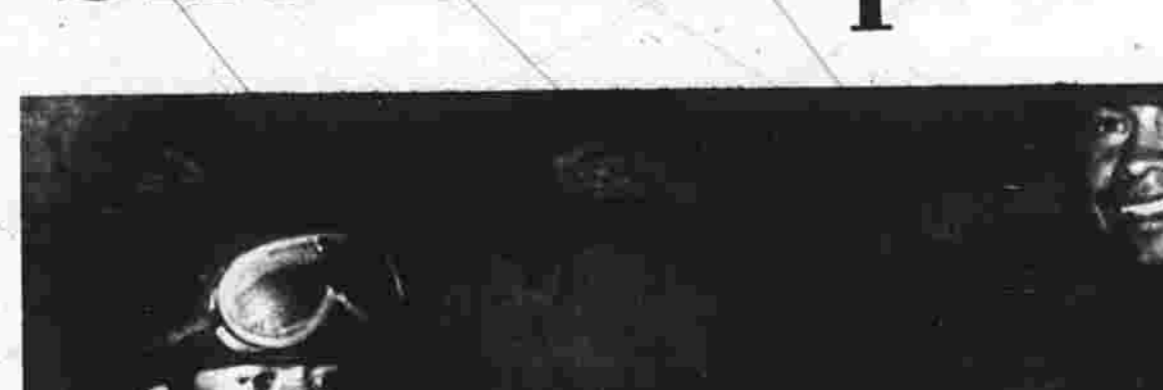
Soldiers cut a student's hair after he was arrested early in the shooting battle in Mexico City's Tlatelolco area last night. More prisoners stand against wall in background.